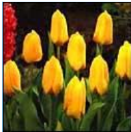
Figure 4: Candela