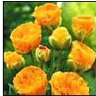
Figure 2: Beauty of Appeldoorn