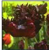
Figure 3: Black Parrot