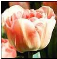
Figure 1: Angelique

Tulips are classified with perennials but often need to be treated as annuals. Dig up your tulip bulbs once the foliage has died & store them in a cool dry area for replanting in the fall. There are a wide variety of tulips, some are shown in the following figures.