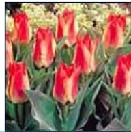
Figure 5: Plaisir

Order your bulbs early enough that they can spend anywhere from 8 to 10 weeks basking in the chill of your frig. Store them in a mesh bag so that they get good air circulation. If you are a fruit lover you may want to strongly consider getting a spare refrigerator – one of the minis so readily available. Fruit gives off ethylene gas – and ethylene gas will kill the flower inside your bulbs.